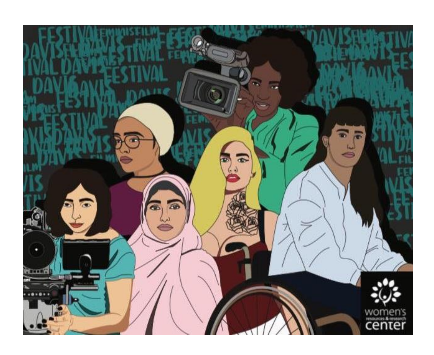
แนวคิด FEMINIST รายวิชาการวิเคราะห์วิจารณ์ภาพยนตร์